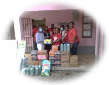
Donewell Life Insurance

To all our Givers, we say AYEKOO. We appreciate your astounding generosity and we say THANK YOU once again.